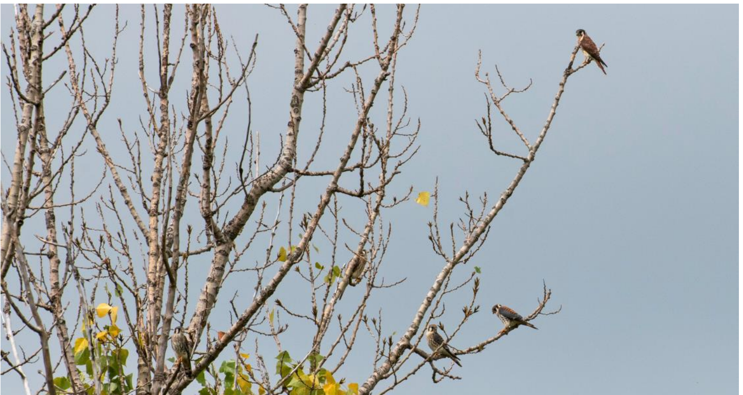
Kestrels in a tree.