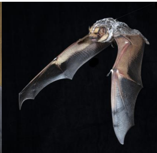
Hoary Bat

Monday, March 25, 2024 @ 7:30pm – presentation to be announced