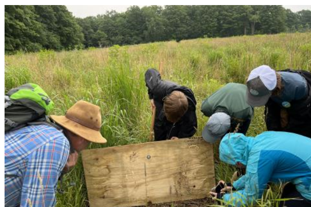
WRN Teens Activities